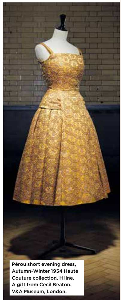
Pérou short evening dress, Autumn-Winter 1954 Haute Couture collection, H line. A gift from Cecil Beaton. V&A Museum, London.