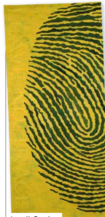
Leave No Trace by Linda Bilsborrow